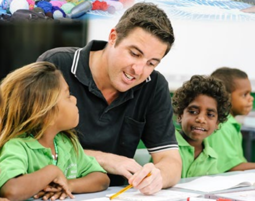
Luurnpa Catholic School, Balgo Hills Christ the King Catholic School, Djarindjin Lombadina John Pujajangka-Piyirn School, Lake Gregory / Mulan

They also have opportunities to grow and learn personally by: